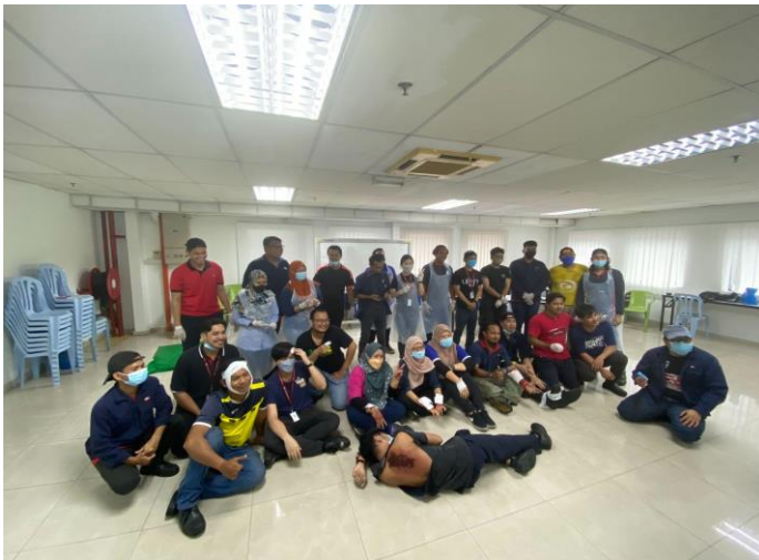
The end of basic first aid training with ASEC's trainers.